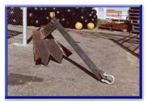
Figure 3.Example of proposed anchor