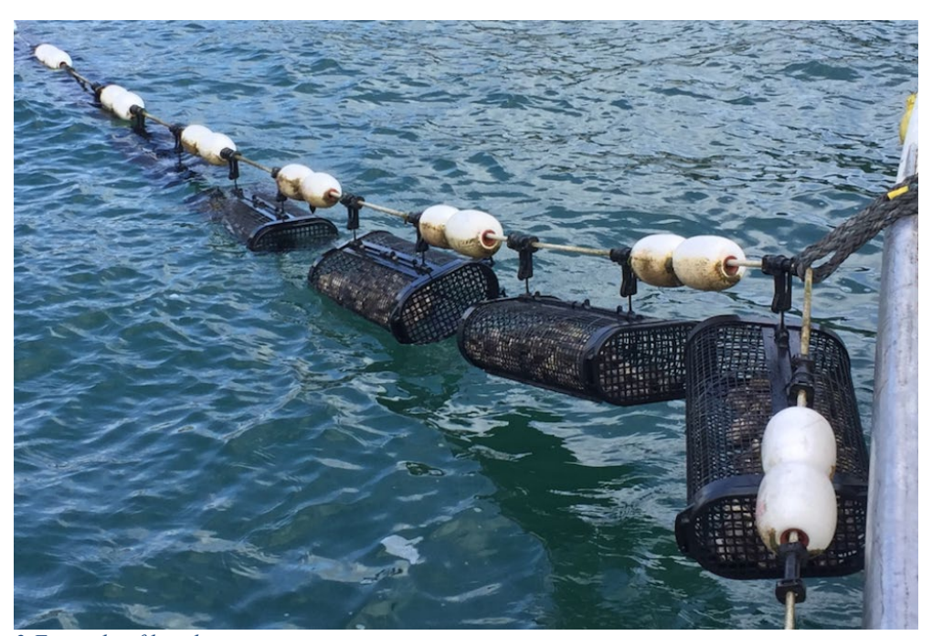
Figure 2 Example of longline system